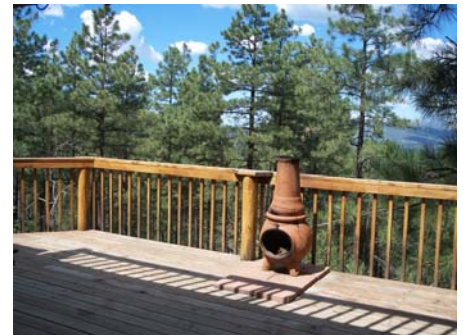
Chimenea with amazing forest views