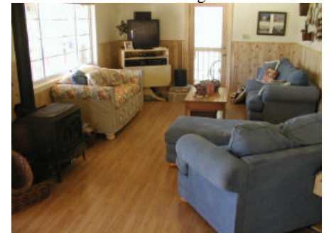
Open Family Room