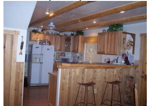
Kitchen view w/track lighting