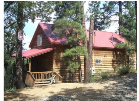
Front View of Home