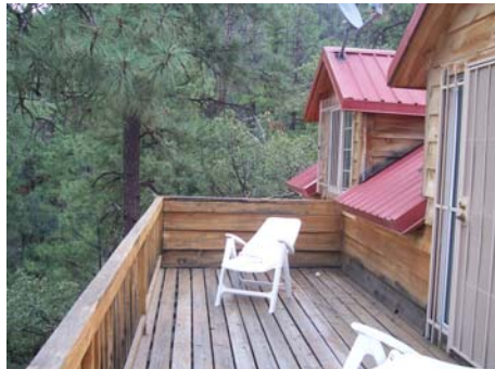
Private Second Floor Deck