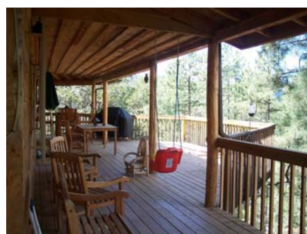
Wraparound Covered Deck w/amazing views