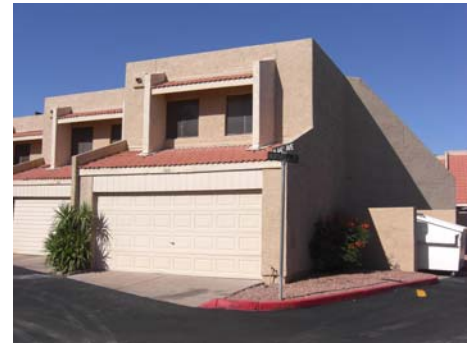
Street view looking east