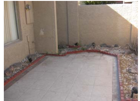
Open Fenced Patio (in shade after 4pm).