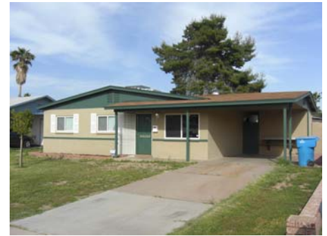
Street view looking east