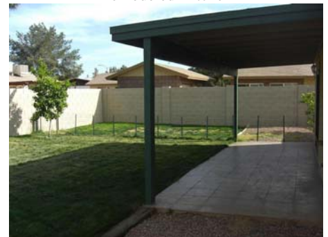
Extended Covered Patio.